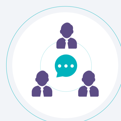
Key partnerships in digital ecosystems