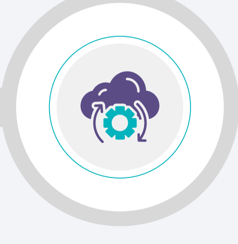
Core enterprise systems in cloud

Learn why Leaders coped better during the pandemic than Followers. Read the full report here: http://on.tcs.com/covid19impact