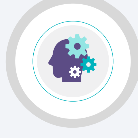
Robust AI-based analytics