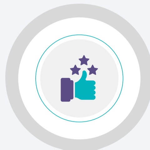
End-to-end digital customer experience