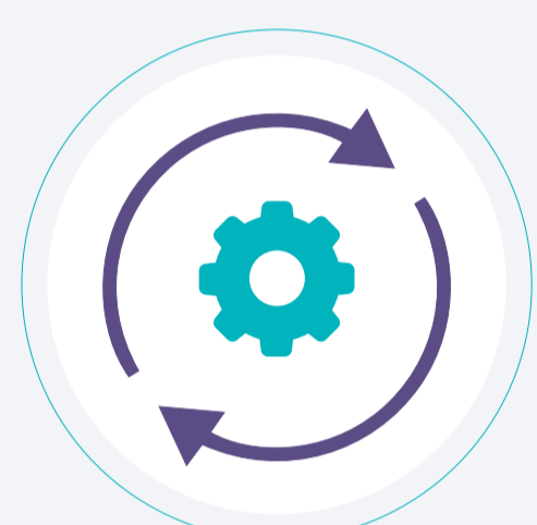
End-to-end digital customer experience (CX)

Six essential digital capabilities set Leaders apart