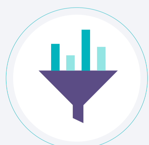
Core enterprise systems in cloud