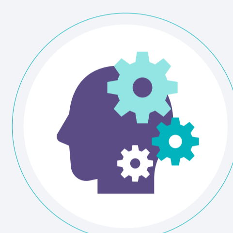
Robust AI-based analytics