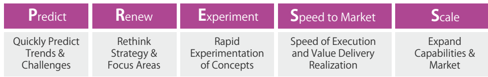
Figure 1: The PRESS Framework for driving business agility

From ideation to execution, business needs to think and act agile, and align with the IT and Operations teams. They need to collaborate and operate with a single vision of delivering value to the customers. Presented below is a framework for driving business agility (see Figure 1).