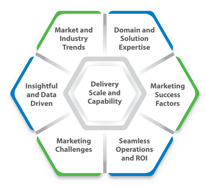
TCS' Strategic Marketing Services for BFSI Industry