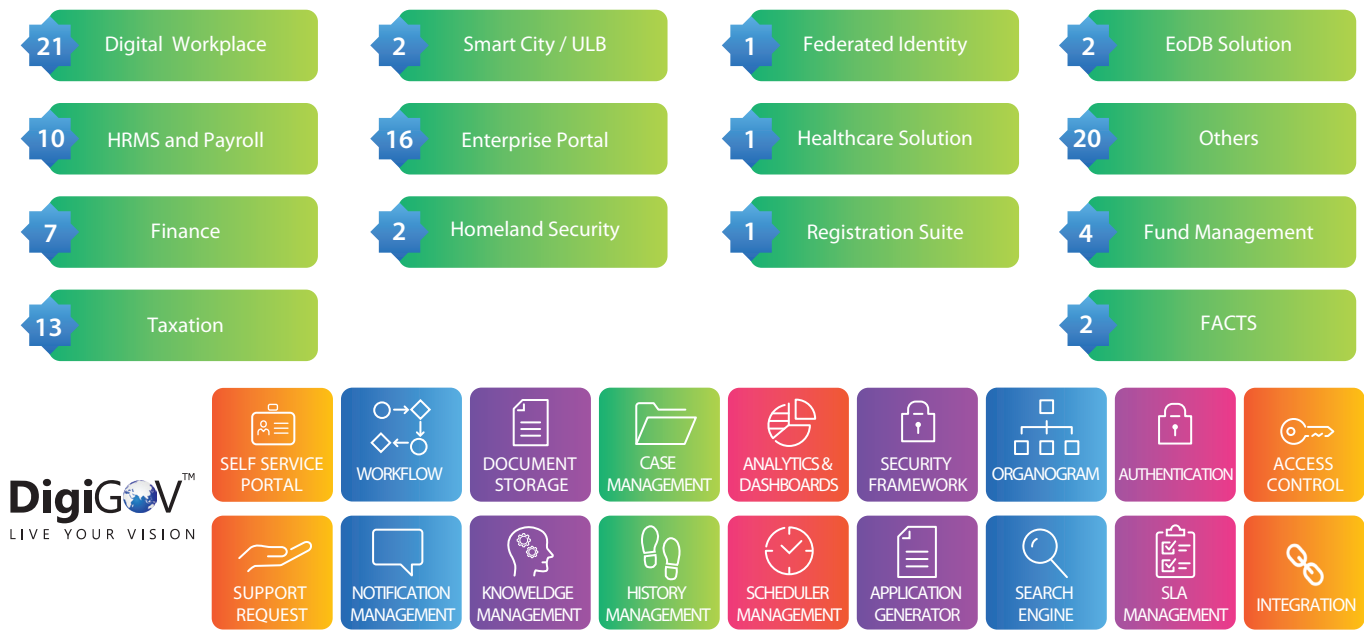
Figure 2: TCS DigiGOV™ Framework with offerings and number of implementations