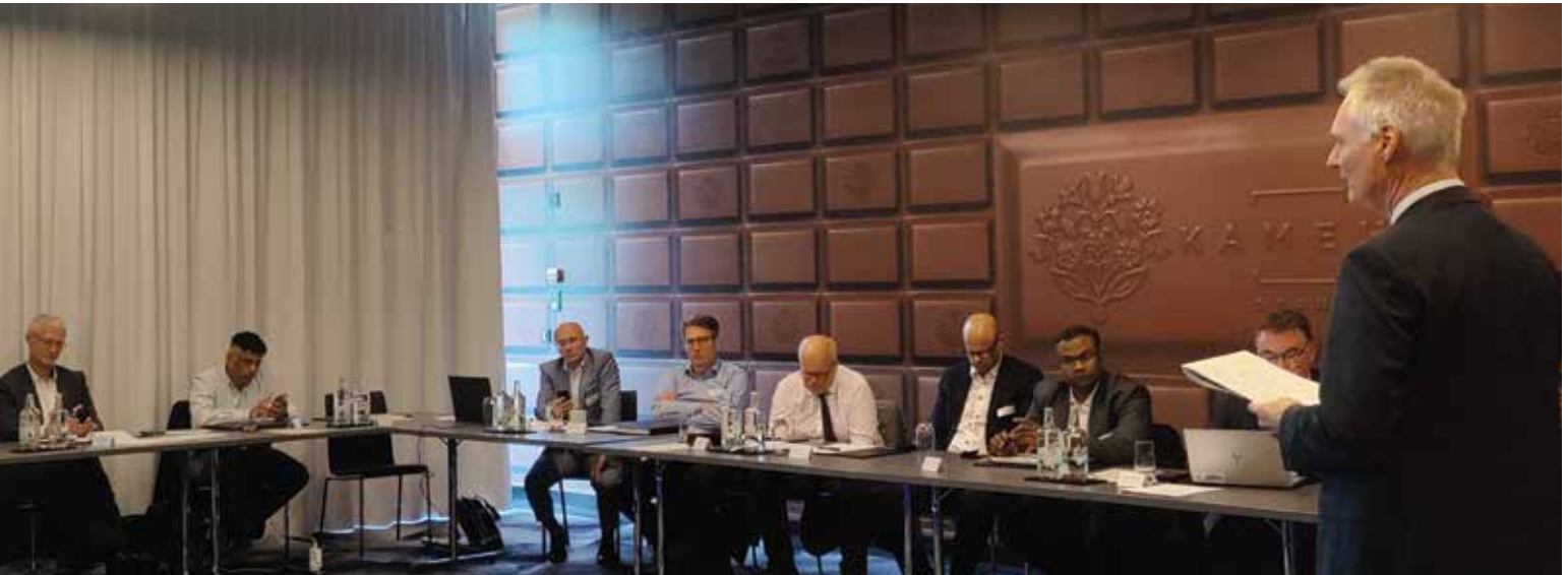
Bitcoin Suisse explaining their offering

and the functional and technology roadmap for the coming couple of years. This presentation was enriched with healthy discussions revolving around the co-existence of traditional components and microservices, TCS BaNCS' API strategy, enterprise data layer offering and the TCS BaNCS Academy (training).