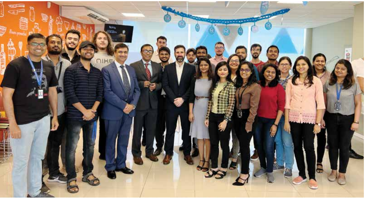
TCS BaNCS team at the TCS office, Uruguay