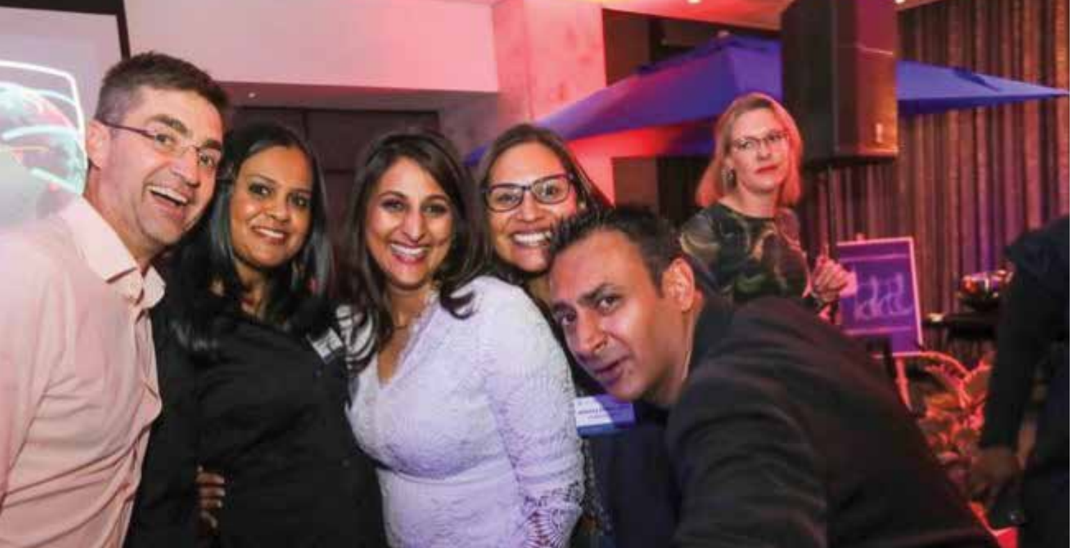
Celebrating the successful go-live – Standard Bank and TCS teams in South Africa