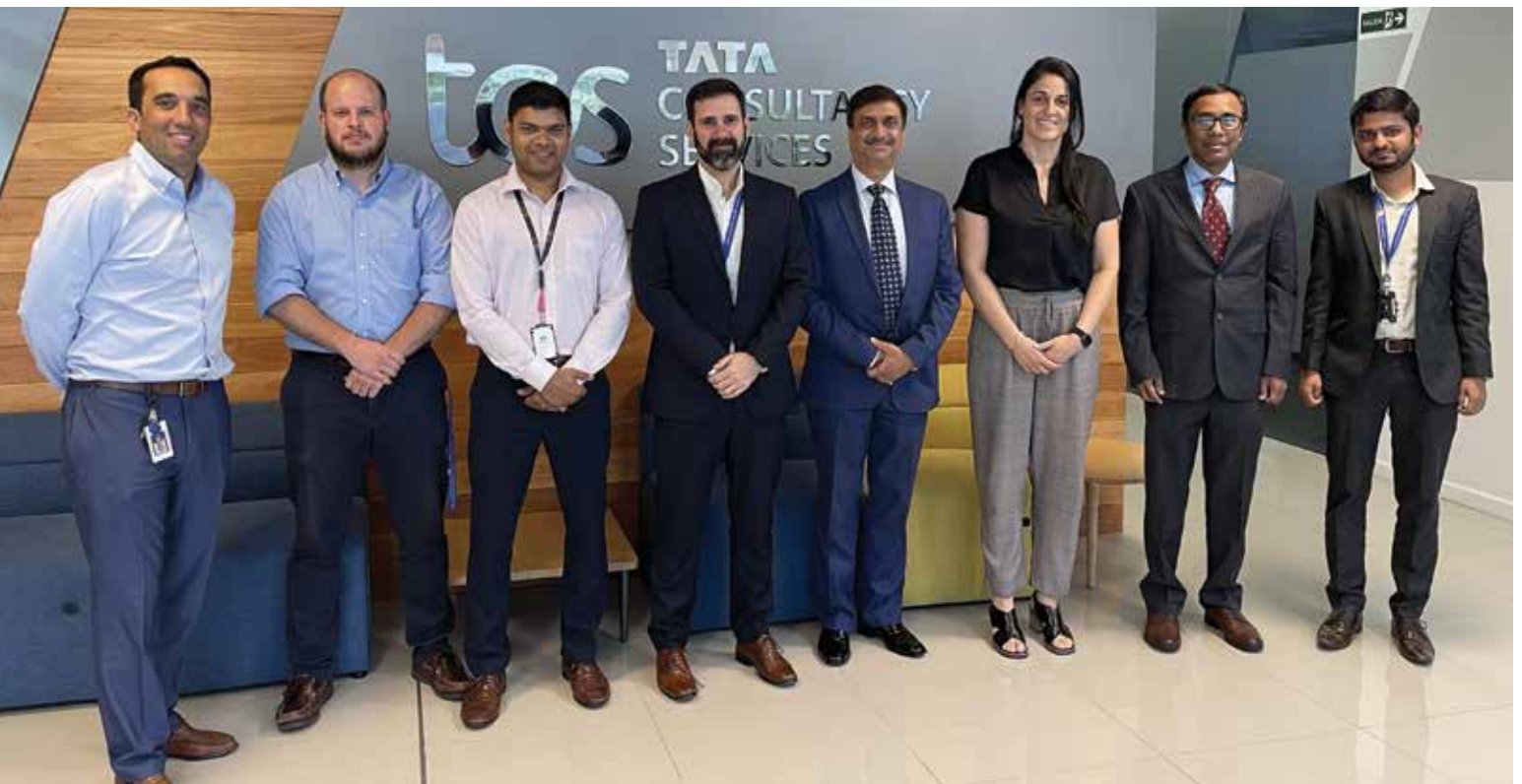
The leadership team