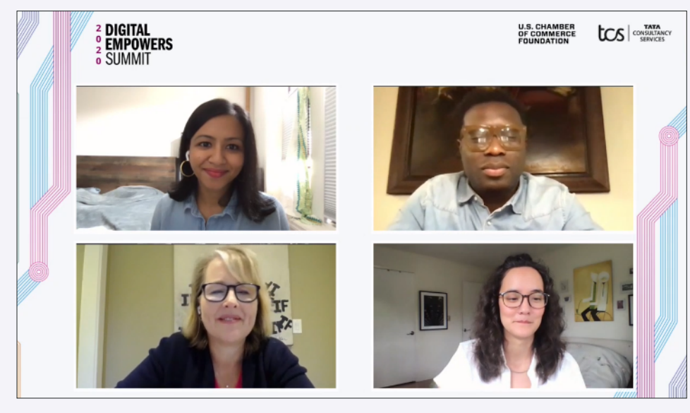
Through the lens of civic engagement, wellness, and workforce development, panelists address the importance of creating for the user, combating bias, and providing for all in the new tech age.

Similarly, Mon Ami, is working to address sections within the community which may otherwise be overlooked. While they're working to bridge the digital divide across generations, Mon Ami is simultaneously addressing mental health issues including loneliness and social isolation during the COVID-19 pandemic. The platform allows volunteers to connect and engage with seniors in a secure digital environment, to provide companionship, reduce isolation, and ultimately reducing the mental health implications the pandemic has induced. 45