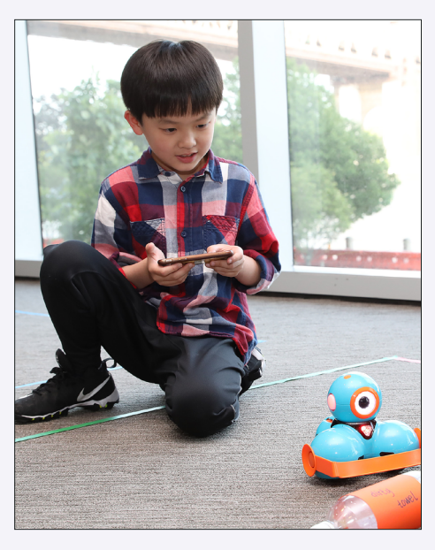
Student uses computational thinking to design a robot to complete daily tasks.