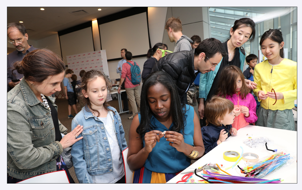
Families participate in computational thinking activities with Ignite My Future in School.

The most notable technology that has successfully been adopted by the education system recently is cloud platforms and open collaboration tools. Partly due to the necessity brought on by the global stay-at-home orders and in part due to the COVID-19 pandemic, online learning has become an essential mode towards creating an accessible pathway to connect learners to resources and foster continuous education. As discussed during a Digital Empowers forum focused on Creating Pathways to the Skills of the Future in 2021, speakers noted the importance of utilizing digital tools and technology as an enabler of education, but that it can't be enabled by those without access. As a result of the pandemic, youth from rural and underserved areas that lack this access and have fallen nearly a full year behind their peers. To bring them back up to speed, technology can