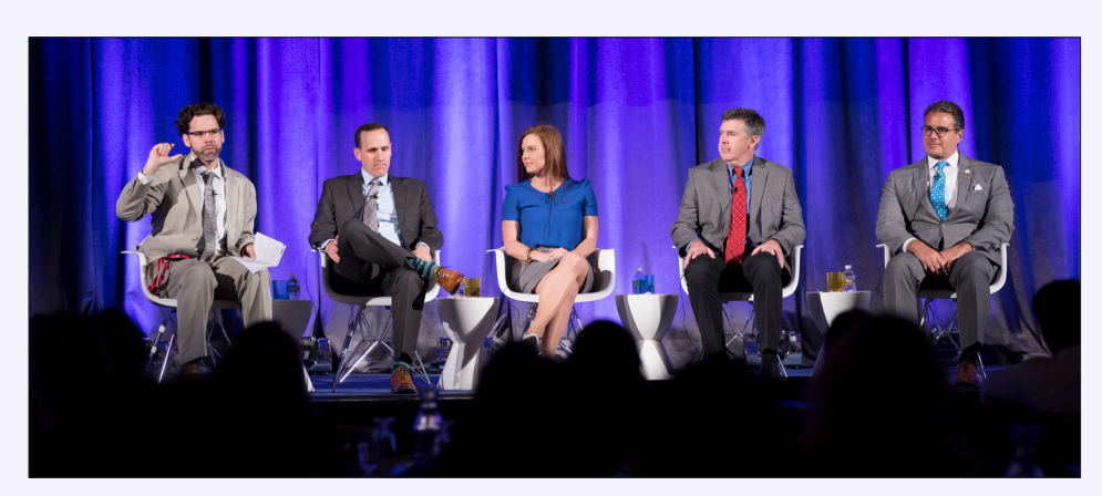
Innovators across industries will share how they apply blockchain technology to address issues ranging from the opioid crisis and food safety to financial access in emerging markets.

Building awareness of the skills of the future requires there to be equitable access to opportunities. Communities that are less connected to the digital economy are at a particular disadvantage, and in order to meet future skills demands, it is essential to drive awareness of education and skilling opportunities within marginalized communities. Comcast NBCUniversal has been working on these issues since well before the pandemic. At the Digital Empowers Atlanta Regional Forum in 2018, The Farm, Comcast's corporate accelerator, featured their work to support local entrepreneurs. The accelerator focuses