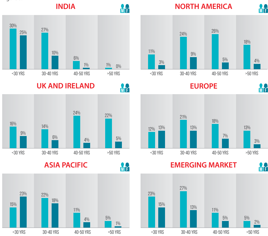
Figure 6: TCS Employees by Region, Age and Gender

TCS has a highly educated workforce of 424,285 employees as on March 31, 2019. Our workforce is predominantly young, with an average age of 30.7 years. A break-up of the workforce by region and gender is provided in Figure 6.