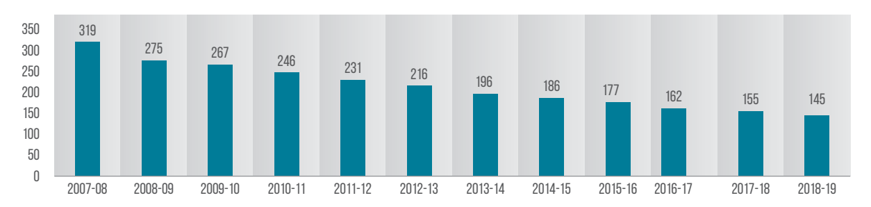
Exhibit 9: Longer term trend in specific electricity consumption<sup>36</sup>