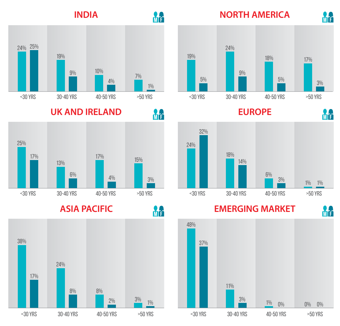
Exhibit 7: Break-up of new hires by region, employee age, and gender

Along with being the largest IT recruiter in India for many years, we believe we were also the largest net recruiter in the IT-enabled services industry in the US in FY 2018-19. TCS has been recognized for industry-leading job creation in the American IT Services sector over the past 5 years.