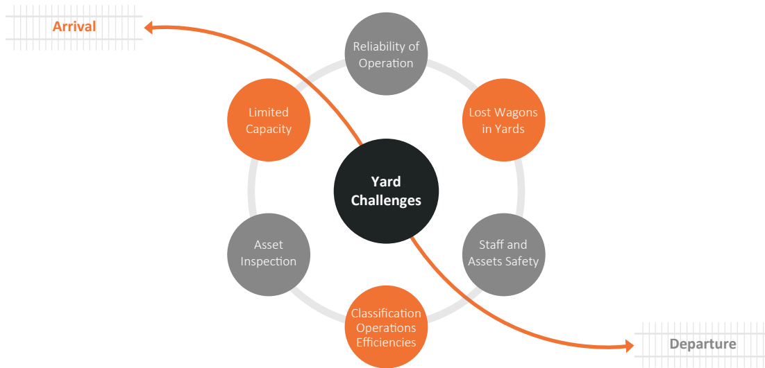
Figure 1: A typical sequence of events happening in rail yards resulting in delays in train arrivals and departures

Typically, railway operating companies and rail yards are responsible for managing the timely movement of cars or wagons. Factors including non-availability of mainline tracks, discrepancies in documentation, defective wagons and limited track capacity cause delays in train arrivals and departures. Delays in departures lead to congestion in rail yards leads to rescheduling of traffic on mainline networks, and the cycle goes on (Figure 1) activities.