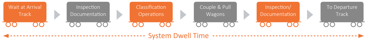
Figure 2: Flow of Activities in Rail Yards

Freight and passenger operators have to work towards optimum utilization of resources and avoid delays. Delay in any single activity (Figure 2) derails the overall train schedule.